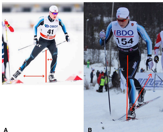
Figure 1 (a) Skating technique involving abduction/adduction and internal/external rotation movements of the hip. (b) Classic technique with a primarily flexion/extension hip movement pattern.

study was to compare the presence of CAM-type FAI in a cohort of elite junior CC (EJCC) skiers with a control group of non-athletes (NA).