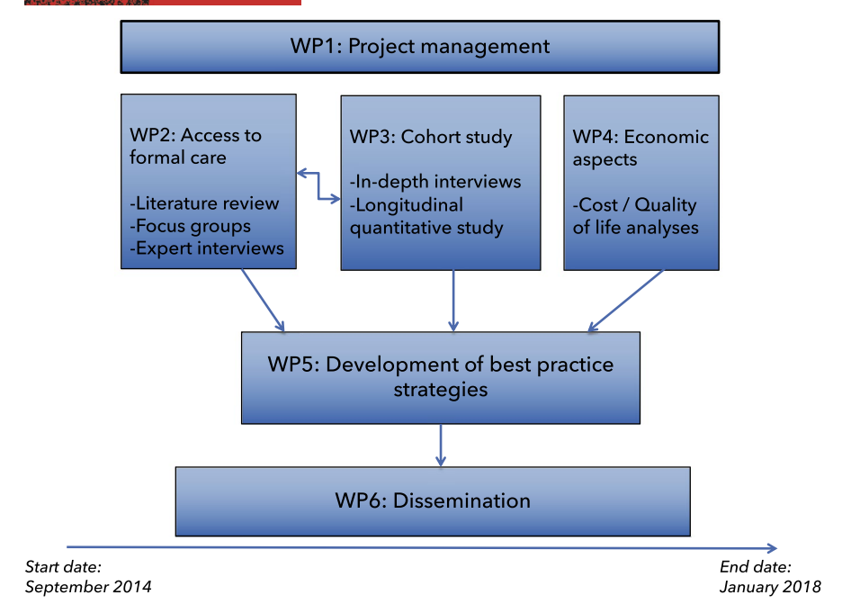
FIGURE 1 The design of the Actifcare study

describe in more detail the optimal circumstances for timely access to care.